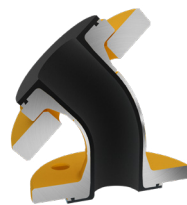
Elbows 45° in Antistatic version