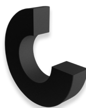
Spacer Type F in Antistatic version