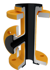
Reducing Tee in Antistatic version